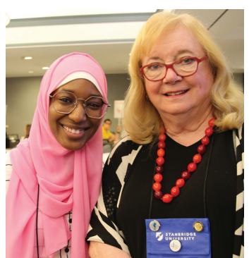
OTAC 2023 Annual Conference & Expo | 12