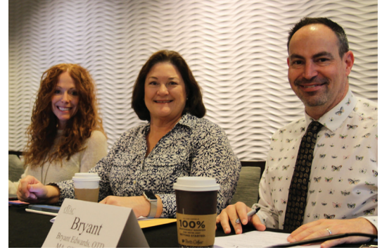
OTAC 2023 Annual Conference & Expo | 32