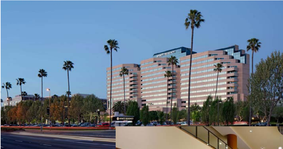
Hyatt Regency Santa Clara 5101 Great America Parkway Santa Clara, CA

...for one of the largest state OT conferences in the country