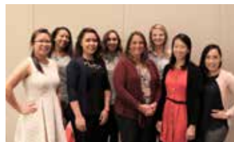
2019 CFOT Awardees

The annual fundraiser for the California Foundation for Occupational Therapy (CFOT), held in conjunction with the