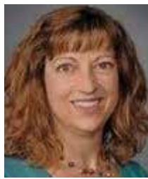
Winifred Schultz-Krohn, PhD, OTR/L, BCP, FAOTA

Conference attendees will have access to the sessions for two months following the presentations. The unique benefit of the virtual format is the ability to attend sessions that were scheduled simultaneously. If two sessions are scheduled simultaneously, you can attend one session “live” and then attend the other session as a recorded presentation. You will also have the availability of returning to view presentations a second time! The OTAC 45th Conference is truly designed to help every attendee feel Resilient. Renewed. Rising!